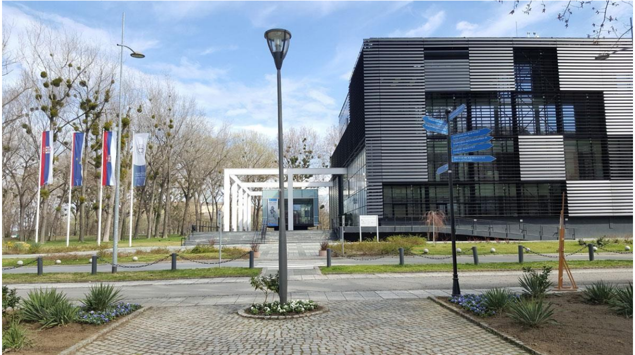
University of Novi Sad – Central (Rectorate) building and IPS 2018 conference venue

Address: Dr Zorana Đinđića 1, 21101 Novi Sad