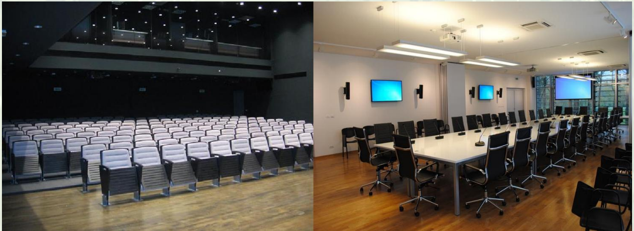
Plenary and meeting rooms